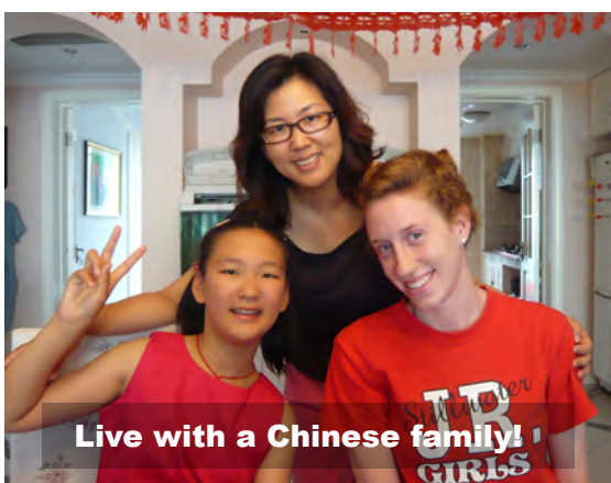
Live with a Chinese family!

I also travelled to other cities as the only foreigner in a group of 20 Chinese reporters which gave me an exclusive insight on China through the eyes of a reporter, an experience which in today's society I consider being priceless."