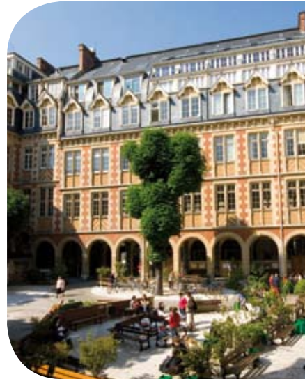
The main courtyard