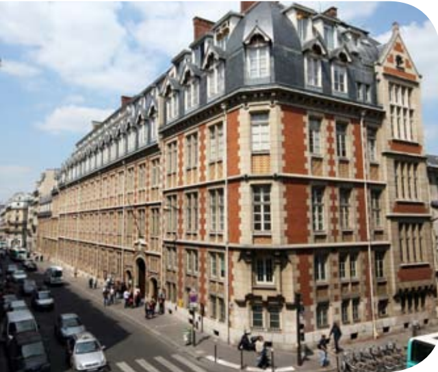
The Catholic University of Paris from outside

Learn French in a private university in the heart of Paris!