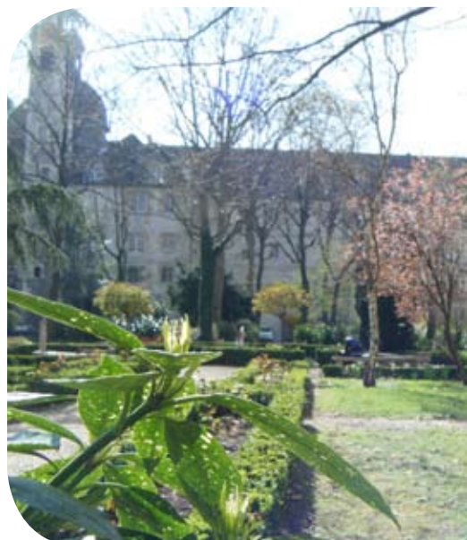
The 'Carnes' garden