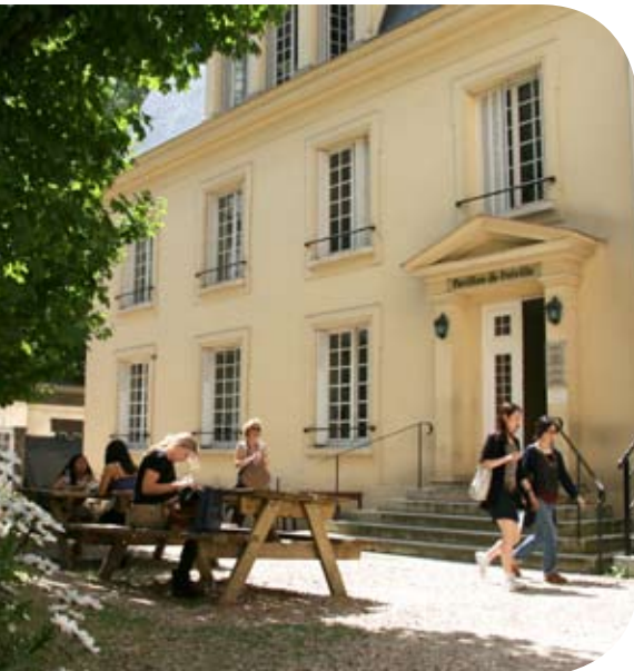
The 'Fréville' building