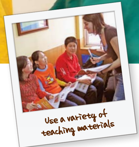
Use a variety of teaching materials

As English continues to emerge as the global language, the demand is incredibly high and always on the rise. Speaking English can mean a better life, more money and greater futures for local communities abroad.