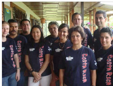
Teachers in Turrialba