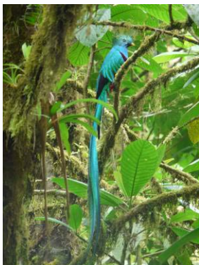
The famous Quetzal

Birdwatching is a personal experience. Some like to walk and chat and others like to observe a tree for hours just to find that one special bird. We will make sure we know the student's specific interests before starting the excursion. The first excursion will take place on the "Quetzal Trail" and depending on the time of year, students may see birds like the Three-wattled Bellbird, the Resplendent Quetzal, wrens and the Fiery-throated Hummingbird. The second excursion will take students to a place known as the "Continental Divide" (known as the one of the best birdwatching locations in Panama) to see birds like Jays, Toucans, Aracari's and Trogons.