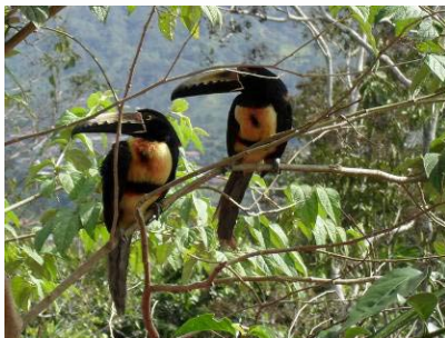
Toucans in front of the School

The first excursion, in CATIE (Tropical Agricultural Research and Higher Education Center), will provide opportunities to spot lots of bird species including water birds like herons, egrets and sun bitterns and will finish in the library with some literature consultation. The second excursion, to the Biological Reserve “Espino Blanco” located at an elevation of 1100 meters above sea level, will surprise students with the variety of hummingbirds, toucans, motmots and with some luck, trogons!