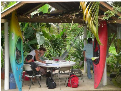
Group lesson in a rancho

Spanish by the River in Turrialba, founded June 2002, is located a little outside of town in the mountains surrounding Turrialba. The school has a large balcony with beautiful tropical scenery (the toucans literally fly over your head!) and a great view of the smoking Turrialba Volcano. Classes are held outside on the balcony and in the tropical garden amidst lush vegetation including grapefruit and banana trees and pineapple plants. There are buses from the School to Downtown Turrialba which are only 140 Colones (about 25 Euro cent). The bus ride takes about 10 minutes.