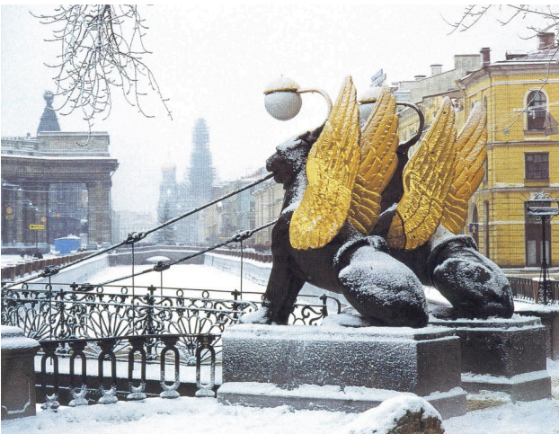
The Bank Bridge in Winter

S t. Petersburg is nice and charming not only in summer, but also in winter. Winter landscapes in combination with magnificent architecture makes the city really great. The nature of the area in winter helps one feel and understand the severe beauty of the North capital of Russia.