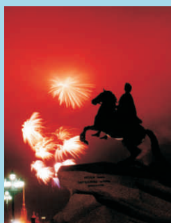
Peter the Great, Founder of St.Petersburg

“Liebe Extra-Class-Team, Vielen Dank fuer die wunderbare Zeit; ihr seit die beste Sprachschule die ich kenne! Alles Gute fuer die Zukunft!”