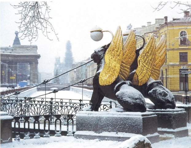
The Bank Bridge in Winter

S t. Petersburg is nice and charming not only in summer, but also in winter. Winter landscapes in combination with magnificent architecture makes the city really great. The nature of the area in winter helps one feel and understand the severe beauty of the North capital of Russia.