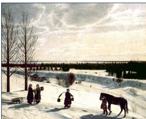
"Russian Winter" by Krylov N.S. (1802 - 1831)

T he annual International Sport Competition in Athletics "Russian Winter". This sport event is one of the biggest athletics competitions in Russia. Its held under the supervision of All-Russia Athletics Federation, is supported by Goskomsport RF (State Sports Committee of the Russian Federation) and is included into the official schedule of the International Assosiation of Athletics Federations (IAAF). The best Russian and foreign sportsmen take part in this competition. The best Russian sportsmen compete there to be the member of Russian national team.